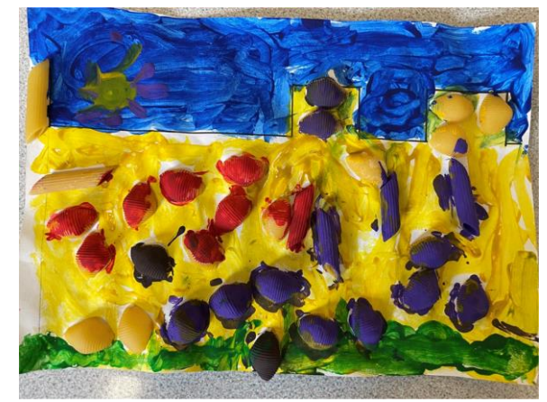
The tower of London and the Gherkin by Y1.

Using different pasta Y1 and Y2 built their own building and painted their version of the building they created.