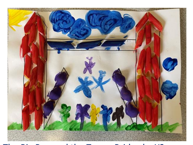
The Big Ben and the Tower Bridge by Y2.